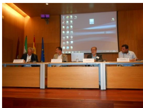
Signature of Cooperation agreement with CAT-MED Platform, Málaga 15 September 2014

Moreover, a cooperation agreement with CAT-MED Platform was signed on September 2014 in Malaga.