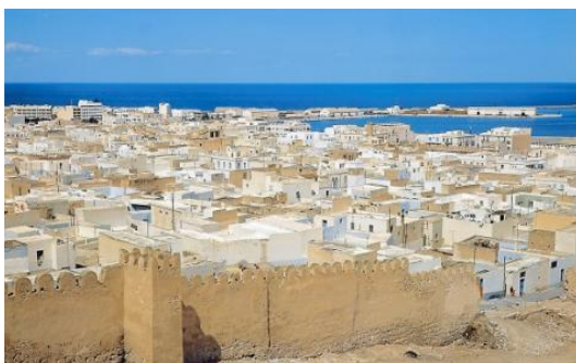
Medina of Sousse

Following the successful experience with the update and establishment of a monitoring system for the PCD of Tetouan, AERYC and the Metropolitan Area of Barcelona, acting as General Secretariat of MedCities, presented a new project proposal to develop a similar project in Sousse.