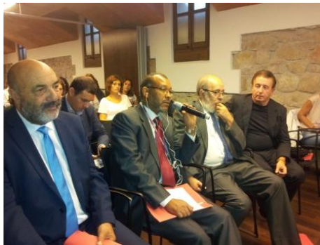
Exchange and training visit of the Delegation of the Communal Development Plan of Tetouan. Barcelona, 13-14 October 2014

The closing mission of this project was developed on 4th-5th November 2014. The project has been funded by the Provincial Council of Barcelona.