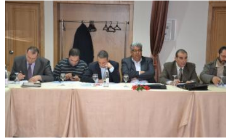
Training session of dissemination of Urban Development Strategies for Tunisian cities, organised by KTC Sfax. 27th February 2014

The KTC hired a consultant to elaborate a project to extend the USUDS project to other Tunisian cities, including the creation of the Local Development Office of Sousse and Sfax and reinforcing the role of Sfax as KTC. The result is the ESDEVET Project (Extension des Stratégies de Développement des Villes en Tunisie). 8 Tunisian cities have expressed their interest in participating: Gabès, Mahdia, Djerba, Monastir, Nabeul, Gafsa, Kairouan and Bizerte.