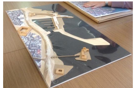
Proposal of the reformulation of the fishermen harbour and the seafront promenade of Saida, by Barcelona Municipality

As a result of these assistances, Barcelona and Saida are working for the signature of a Memorandum of Understanding. Barcelona has also signed a cooperation agreement with the city of Tetouan.