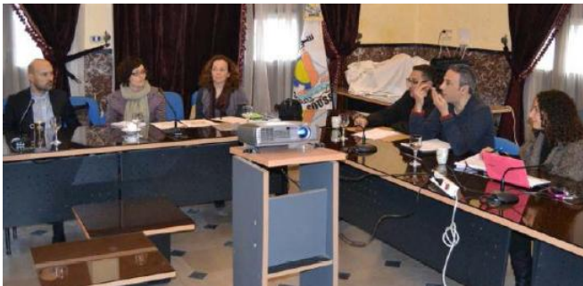
First mission of Barcelona Municipality in Sousse. 26-29 January 2014

The Municipality of Barcelona provided technical assistance to the cities of Sousse on water cycle management and to the city of Saida in the reformulation of the fishermen harbour.