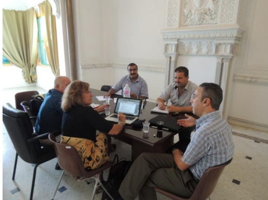
Third technical misión of Marseille in Sousse. 6 October, 2014

The Municipality of Marseille and the Municipality of Sousse have elaborated a joint project to work on urban lighting and energy savings. Marseille is also cooperating deeply with Al Fayhaa in several projects.