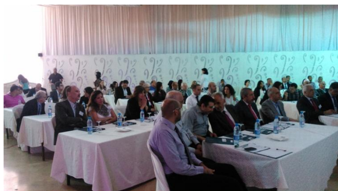
Mashrek Dissemination Seminar on City Strategies, organised by KTC Alfayhaa. Tripoli, 26 June 2014.

Finally, Malaga continues to operate as Knowledge Transfer Centre for Methodology and Best Practices based at CIEDES Foundation, with the support of MedCities General Secretariat.